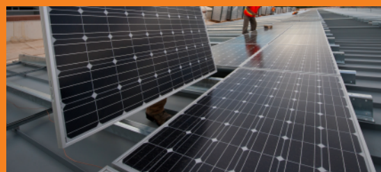
Client Name: M&M Location: Zaheerabad, Telangana Capacity: 1000kW