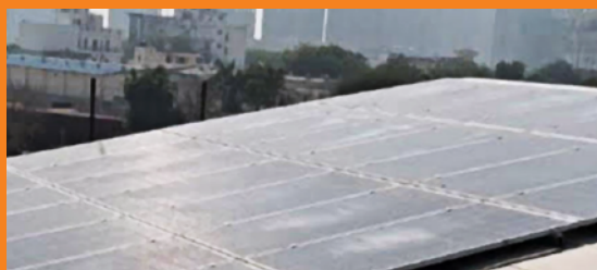
Location: DPS Bungalow, Noida Capacity: 27.33kW