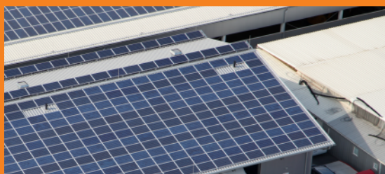
Client Name: Yamaha - Phase 3 Location: Chennai, Tamil Nadu Capacity: 1004.6kW