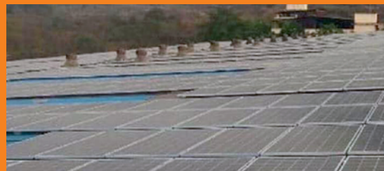
Client Name: Hindustan Inox Ltd. Location: Raigad, Maharashtra Capacity: 1200kW