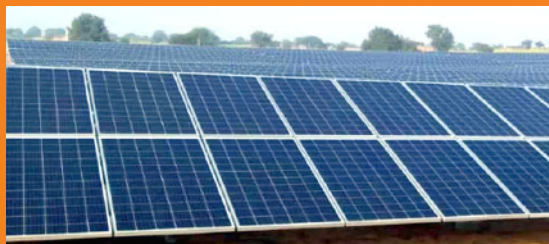
Client Name: Asian Paints Ltd. Location: Bhiwani, Haryana Capacity: 4700kW